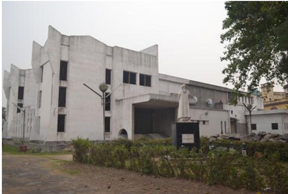
Rabindra Bhavan, Chinsurah