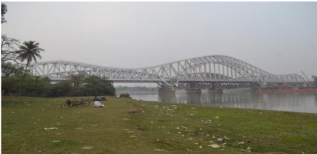
Newly constructed railway bridge beside the Jubilee Bridge