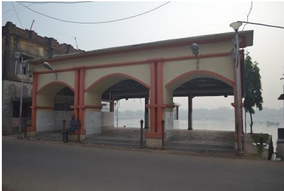
Rani Rashmoni Ghat (Ward No. 12)