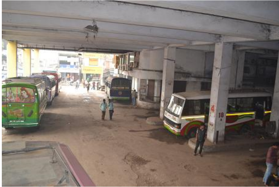
Chinsurah Bus Terminus (Ward No. 19)