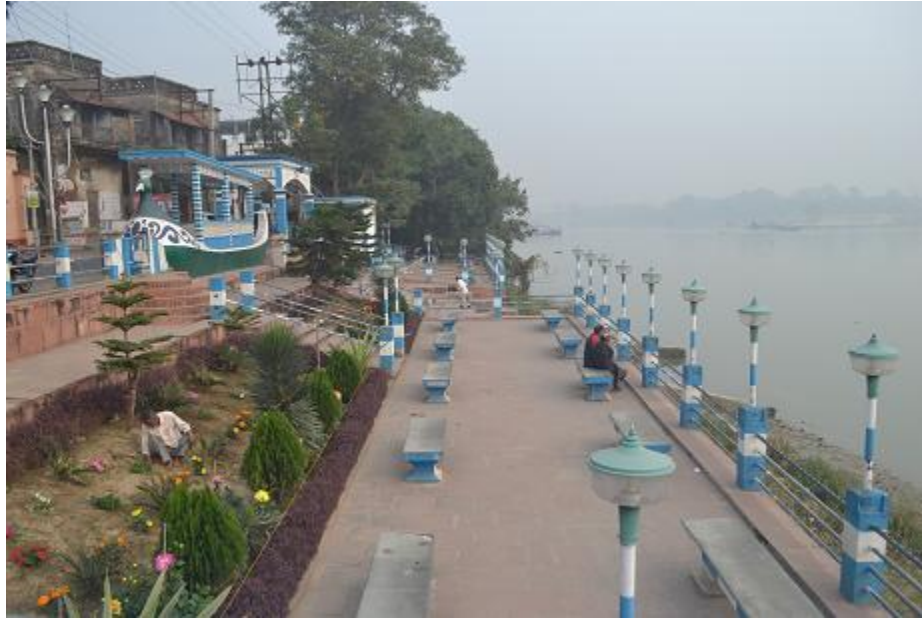
Riverside beautification with park at Mayurpankhi Ghat (Ward No. 13)