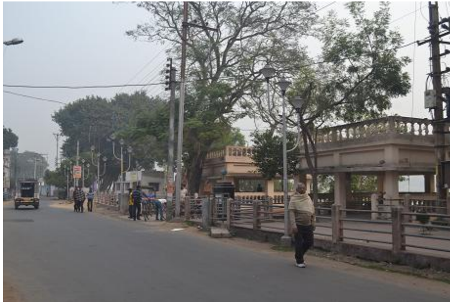
Potli ghat, Pratappur (Ward No. 13)