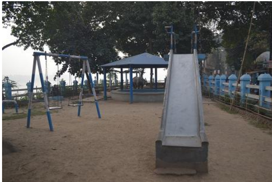
Riverside beautification at Bakultala Ghat (Ward No. 12)