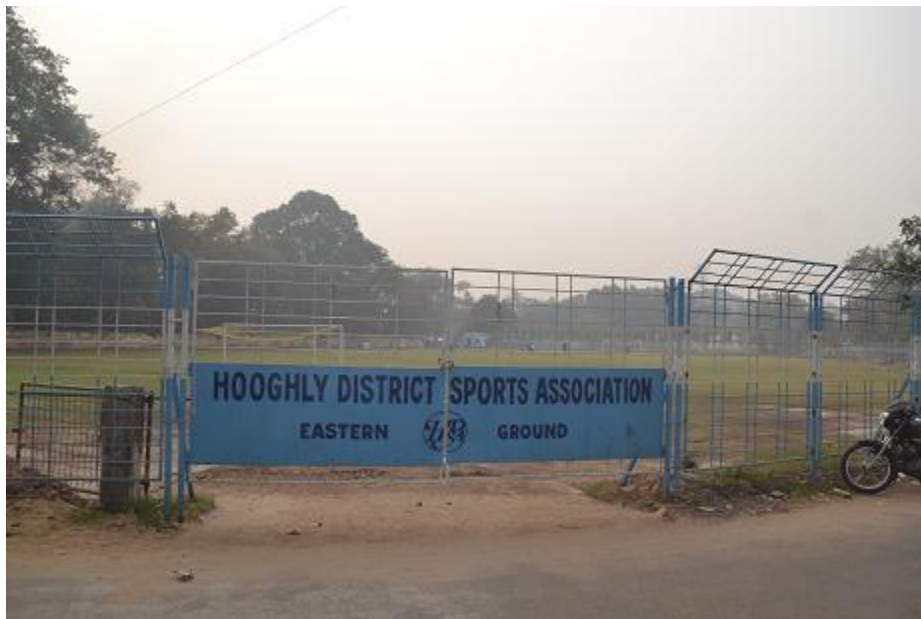
Chinsurah Football Ground (Ward No. 24)